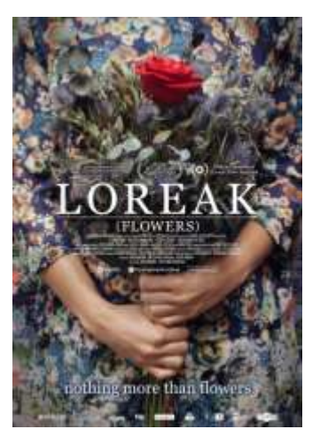
FLOWERS March 10 and 12, 2015

Spain 2014. 99 min. Euskera with English subtitles.